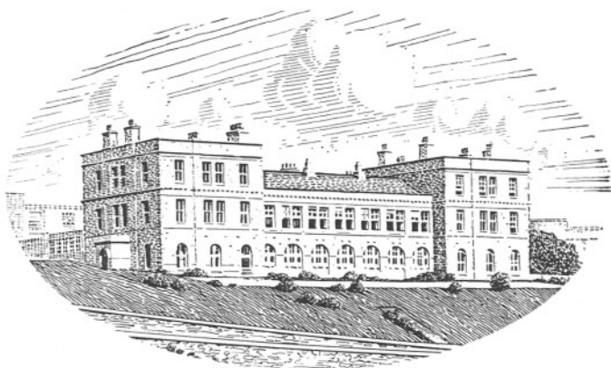
THE PLYMOUTH LABORATORY